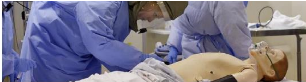
U.S. medical workers receive training on working with Ebola-infected patients. (Elaine Thompson)

🐦 ▾ Can Ebola be spread by a sneeze? CDC seems to change its mind