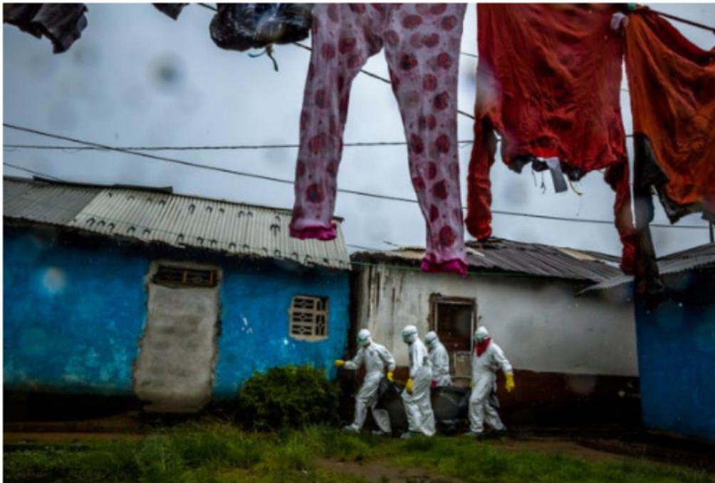
A Red Cross team removed the body of a woman believed to have died of Ebola in Monrovia, Liberia, last week. Officials urge caution in handling victims' bodies.